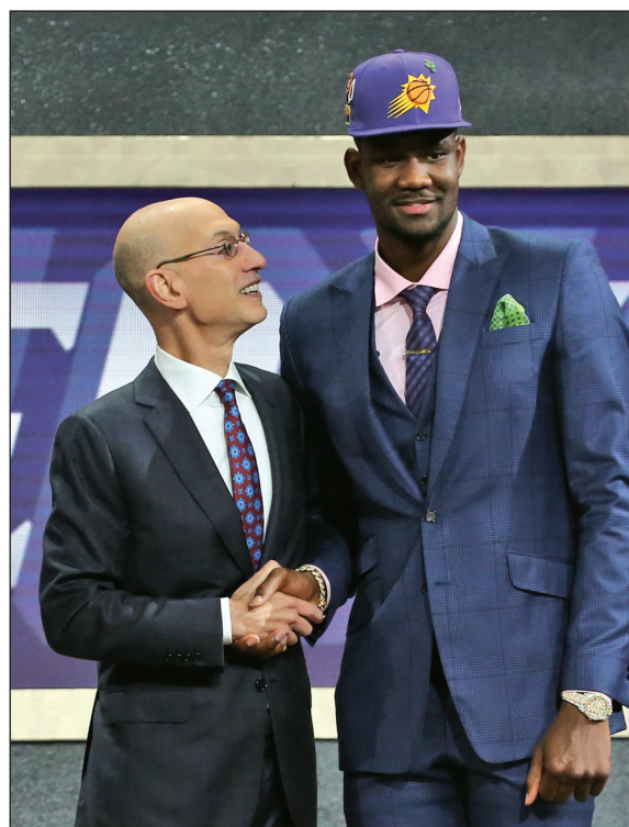
Arizona's Deandre Ayton, right, poses with NBA Commissioner Adam Silver after the Phoenix Suns selected Ayton with the first pick in the NBA basketball draft in New York, Thursday.